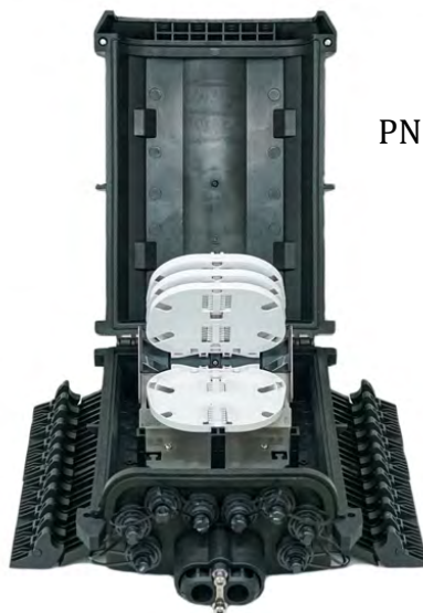
PN: OST Series