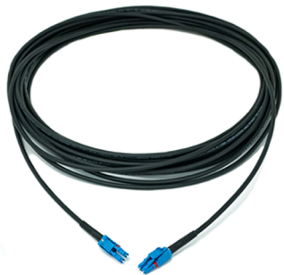
Small Cell Jumpers